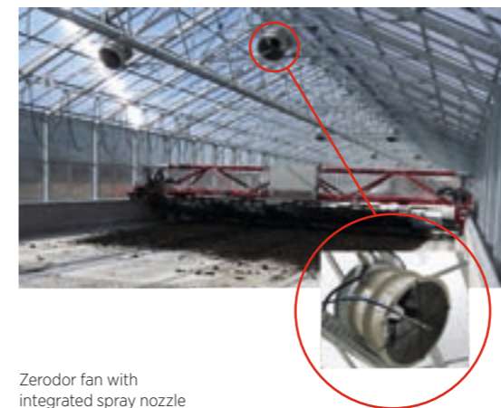
Zerodor fan with integrated spray nozzle

The reagent liquid specially developed for sewage sludge is introduced directly into the odour-contaminated air – either as a fine spray mist or, in the case of high humidity, as an anhydrous vaporiser using ZERODOR DGD (Dry Gas Dispersion) technology .